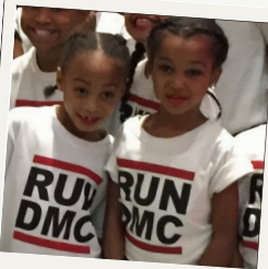
When they were Mini 2014